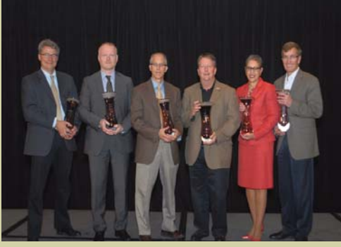
2013 Award Winners