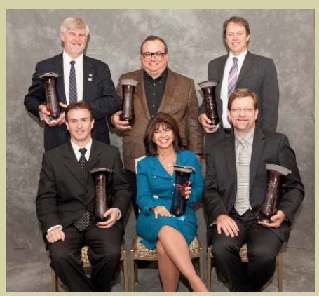
2012 Award Winners